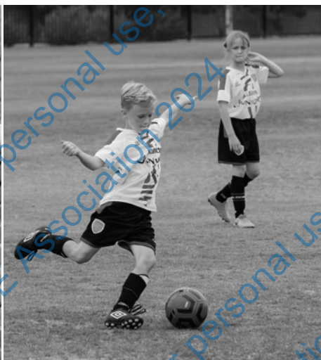
Like the same things