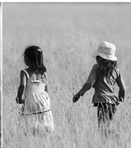
Don't have any other friends