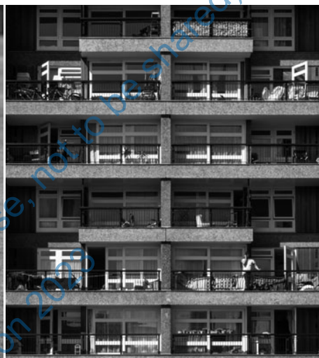
Live near each other