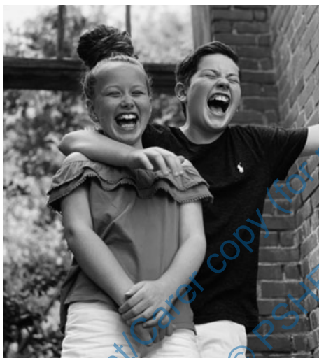
Make each other laugh