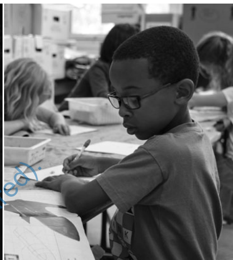
Sit together in class