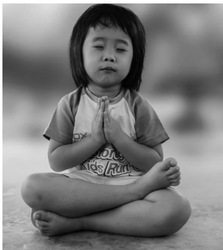
Are the same religion